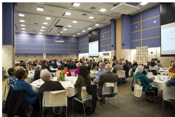
Supporters filled the room at WCSU's Student Center.